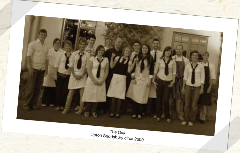
The Oak Upton Snodsbury circa 2009